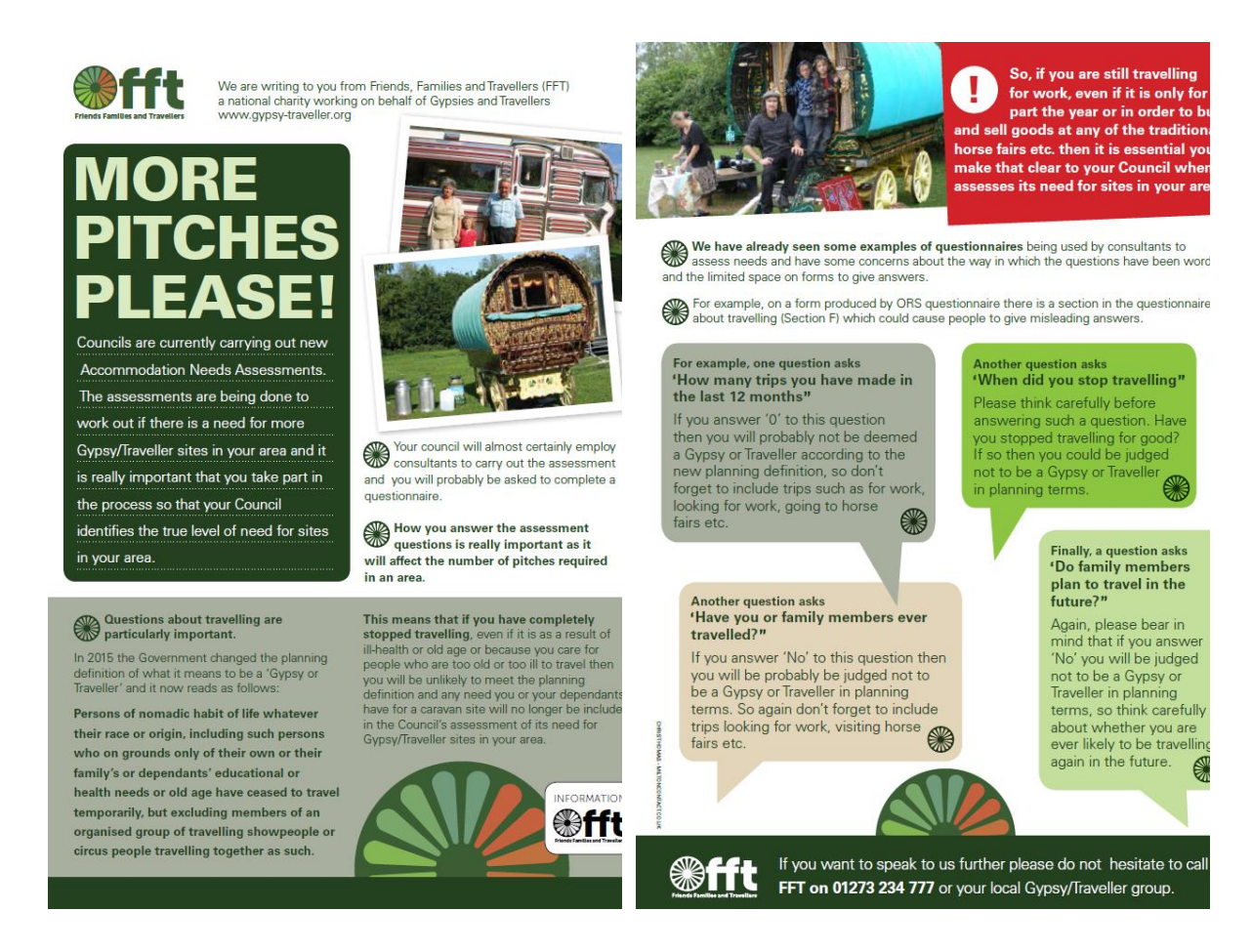
Figure 3 – Friends, Families and Travellers Leaflet