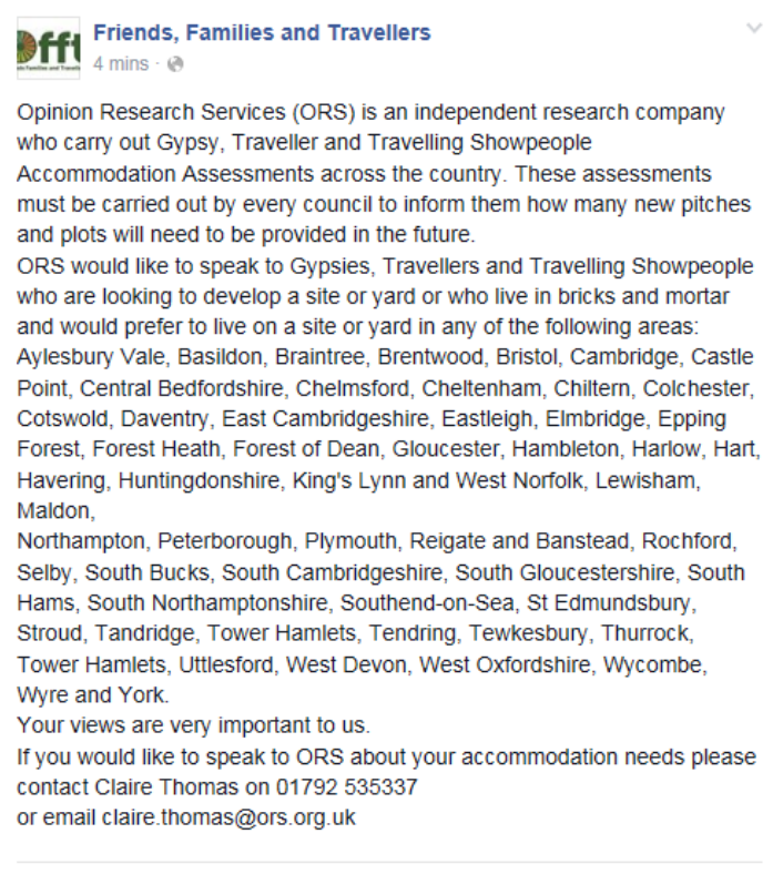
Figure 4 – Bricks and Mortar Advert